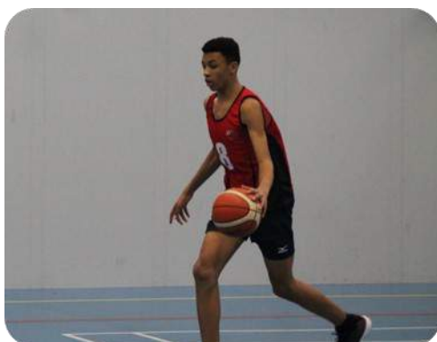
Ashya on the move

At three quarter time I removed the lay-up option from the boys almost completely and said that they were only allowed to lay the ball up if they had a clear path to basket on a fast break. This really stifled the performance on court and the point