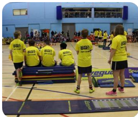
Our leaders soaking up the atmosphere