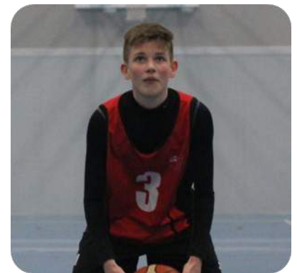
Dexter's unconventional technique

Quarter 3 | SK 42 v 24 NS (SK 15 v 9 NS)