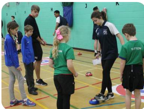
Ruby giving a lesson in measuring