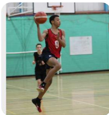
Ashya majestic in starting the fast break