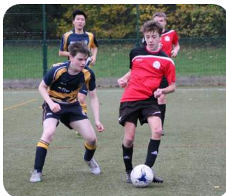
Angus assured in possession