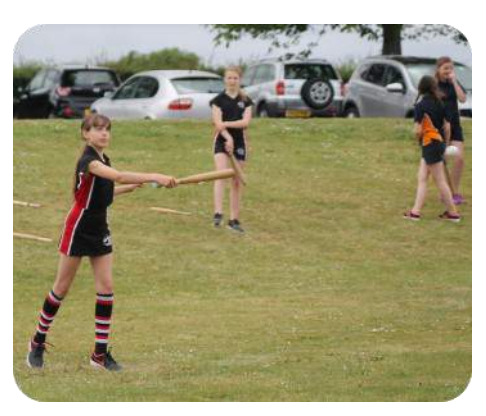
Other results from this fixture include - Year 9: St Katherine's A 5 - 2 Nailsea, Year 9: St Katherines B 5 - 3 ½ Nailsea and Year 10: St Katherine's 3 - 4 Nailsea.