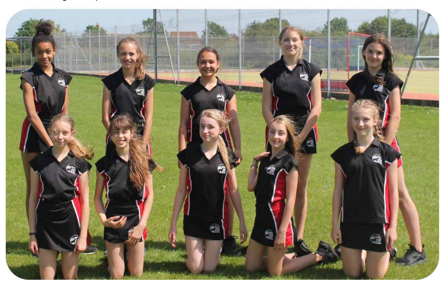
St Kath's 3 - 2 Backwell

The Year 7 girls travelled to Priory for their first ever North Somerset rounders tournament on the 27 June and played 5 matches finishing in third position at the end of the afternoon.