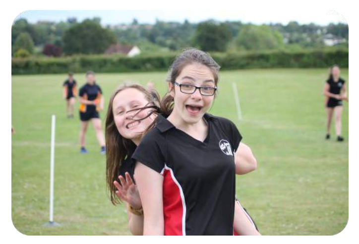
Well done to all ladies involved!